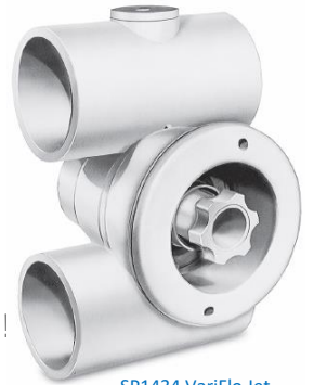
SP1434 VariFlo Jet

The Jet-Air III system is one fitting that does it all – adjustable, fully directional and recessed!