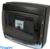
H-Power Control Panel

The Calipso™ Counter-current System ships from Europe and is currently available for 50Hz only.