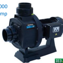
HCP1000 Series Pump

niche for liner and concrete installation, check valve and air pipes, Hayward HCP1000 series commercial grade pump with different capacities suitable for salt water and sea water; and a H-Power electro-pneumatic panel for pump control and protection.