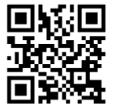
Scan to see how the media works

Contact Hayward IMG to order a sample of PROHAYWARD Blü.