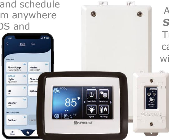
App only. Phone not included,

A Hayward SmartPower® Transformer can be used with the OmniHub® and OmniDirect Mode™ for additional lighting shows, colors and dimming control.