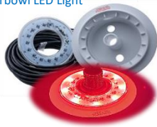
LBCUSXXX Waterbowl LED Light

Add-on dramatic LED lighting integrates seamlessly with Omni® automation and transitions effortlessly from day to night. OmniDirect™ Mode compatible for additional dramatic effects.