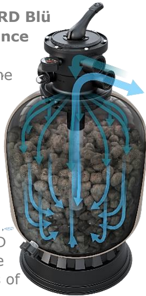
ProSeries™ Filter with ProHayward Blü

PROHAYWARD Blü ProSeries™ Filter with ProHayward Blü lasts longer than sand and will not degrade with flowing water. PROHAYWARD Blü media provides very little resistance to water flow. For variable speed pumps, you can decrease your pump speed and still maintain the same circulation flow rate.