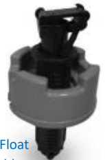
Inner Float Assembly

"SmartSensing" also protects Paralevel so it will not cycle on and off rapidly, like other levelers. This limits the potential for premature failure and eliminates loud water hammer that could lead to damage to plumbing.