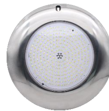
UPR WITH SS Rim

It can also be paired with an optional stainless steel face rim for installation in any US style niche.