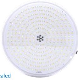
UPR Sealed LED Panel

This light can be used as a complete replacement for the 3478 Eurolight.