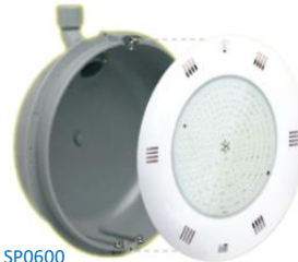
5880 with SP0600 ProHayward LED Niche

The UPR LED Panel can be used as a replacement for PAR56 lamps in the 3478, 3481 and other Euro style lights