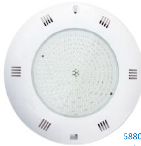
5880 Universal Light

The light has a low profile of only 1.7cm and can also be installed in a ProHayward SP0600LED niche in new installations.