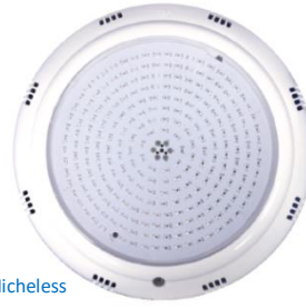
3680 Nicheless Light

The 3680 light is designed for nicheless installation over the pool finishing.