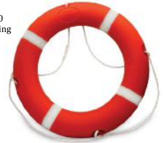
LBO30 Life Ring

The bright orange 30" life ring is manufactured with a long lasting HDPE outer case over a super buoyant polyurethane core. The life ring is fitted with a white nylon rope for easy grasp of the life ring by users and the ring features reflective tapes for added visibility.