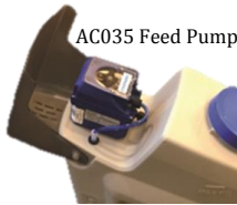
AC035 Feed Pump

Refill is made easier than ever, employing an upright, ergonomic design and convenient built-in handles.