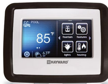
Control Pad Touch Screen

The OmniHub uses the Control Pad touchscreen as the main interface