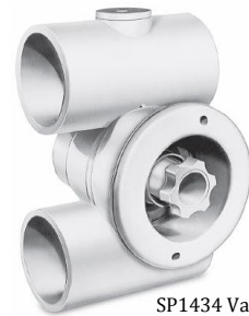
SP1434 VariFlo Jet

The Jet-Air III system is one fitting that does it all – adjustable, fully directional and recessed!