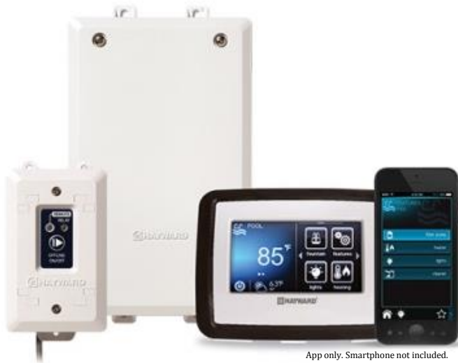
App only. Smartphone not included.

OmniHub includes wiring base unit, control pad and 1 Smart Relay for control of equipment including variable-speed pumps, heaters, pool/spa lighting, spa equipment, AquaRite® salt systems, booster pumps, backyard