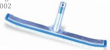
18" Plastic bristled brush with Aluminum backing CWB002

Mix bristle brushes are also useful and long lasting. Stainless Steel bristle brushes must never be used on liner pools.