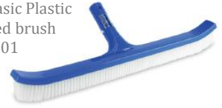
18" Basic Plastic bristled brush CWB001

Stainless Steel bristle brushes are best used on plaster finishes and for removal of stubborn algae and dirt from grouts and other rough surfaces.