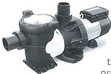
HCP 3000 Series

The new pump is offered with a wide range of power options providing an optimum solution for virtually any pool while delivering maximum performance and uncompromised efficiency.