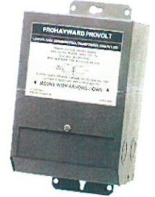
12V/300W ProHayward Transformer

ProHayward transformers complement Hayward lighting choices.