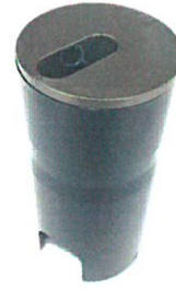
Deck Jet 500

Contact Hayward IMG for further details on Hayward's new water feature selections.